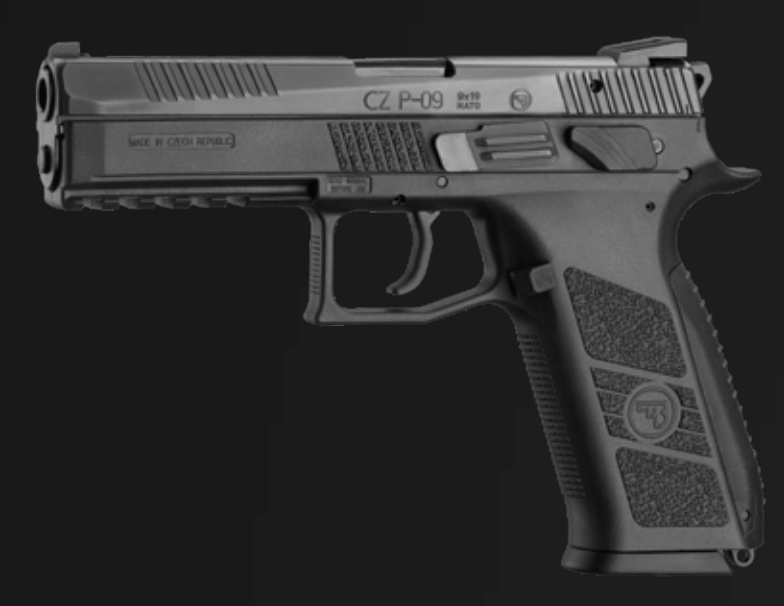
The CZ P-09 is a highly precise, large capacity service pistol designed to function with extreme reliability under the most demanding environmental conditions.