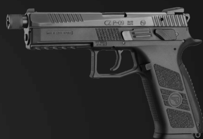
The CZ P-09 SR (Suppressor-Ready) features an extended barrel with 1/2"×28 UNEF – 3A threads and high luminescent sights.