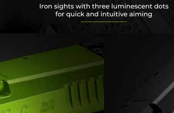
Extremely durable nitride finish on slide and barrel