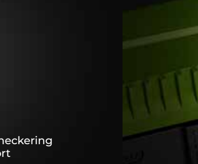
Ergonomic grip with prominent checkering for superb shooting comfort