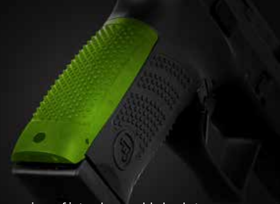
Three sizes of interchangeable backstraps to modify grip and finger reach