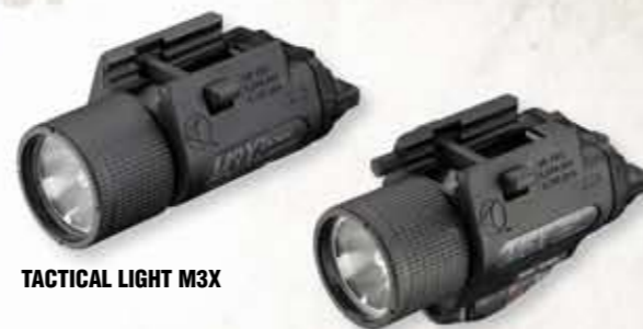
TACTICAL LIGHT M3X