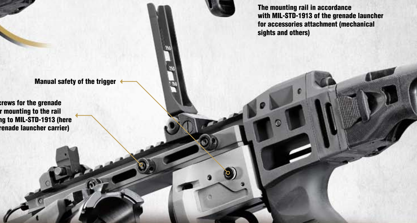
Manual safety of the trigger