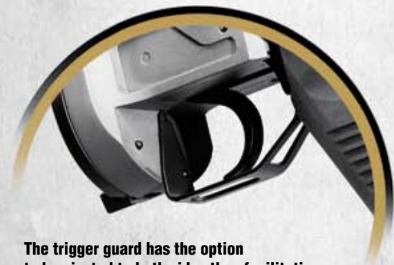
The trigger guard has the option to be pivoted to both sides thus facilitating shooting with gloved hands