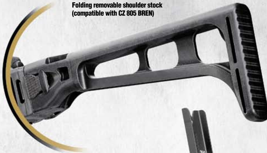
Folding removable shoulder stock (compatible with CZ 805 BREN)