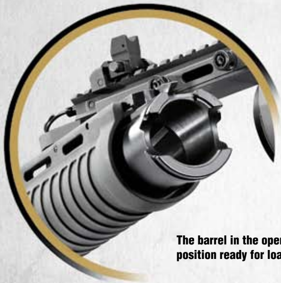
The barrel in the open position ready for loading